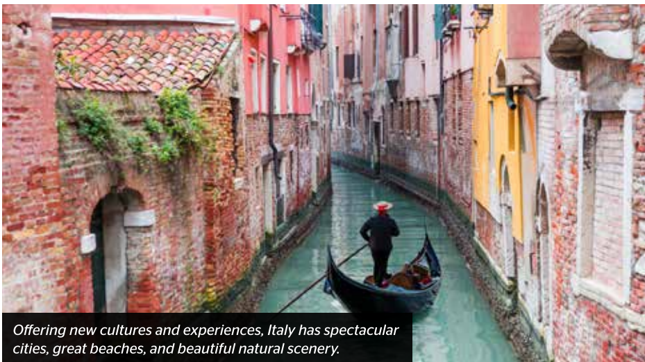
Offering new cultures and experiences, Italy has spectacular cities, great beaches, and beautiful natural scenery.

You'll have to prove to the French authorities that you have a pension or other means of financial support, as well as a health plan to meet the cost of healthcare.